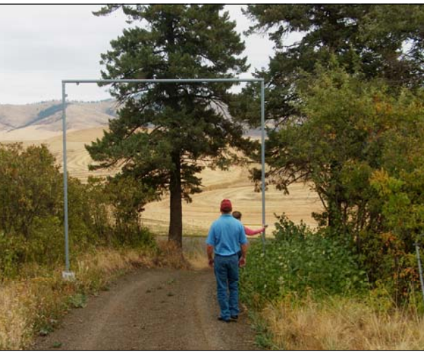
The view to the West