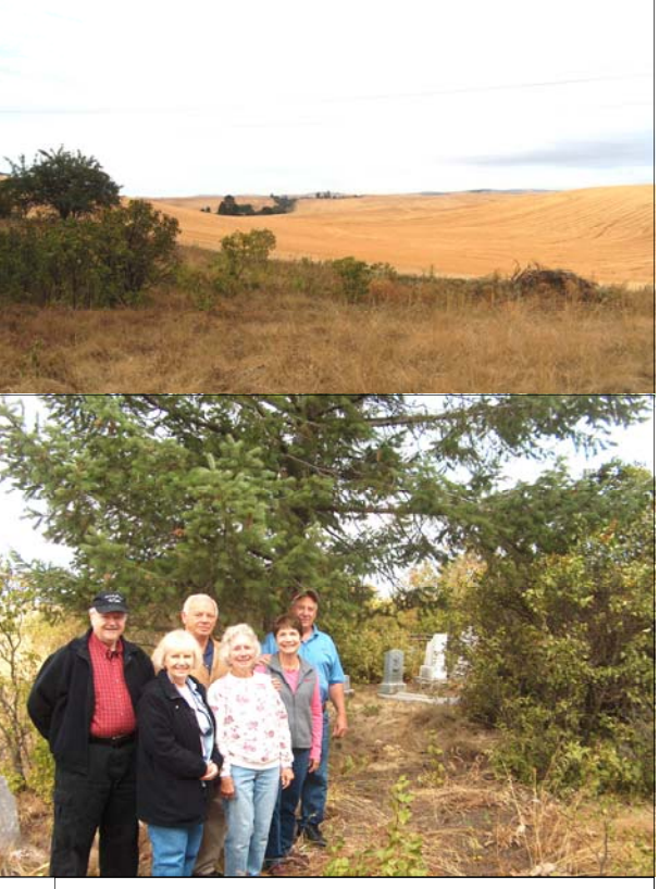
Front to back; Smiley's, Savitz's, Morgan's

Picture to left is a gravestone for twins that